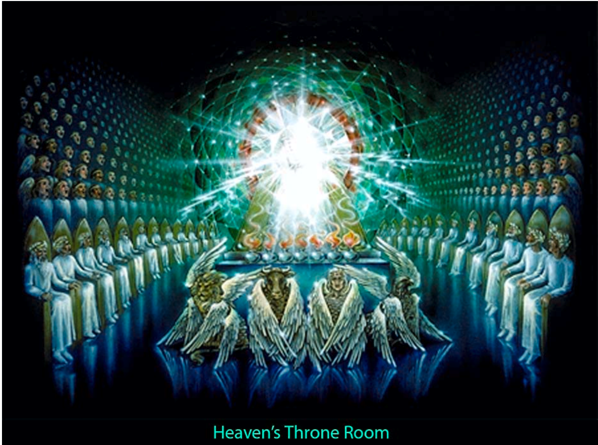
Heaven's Throne Room